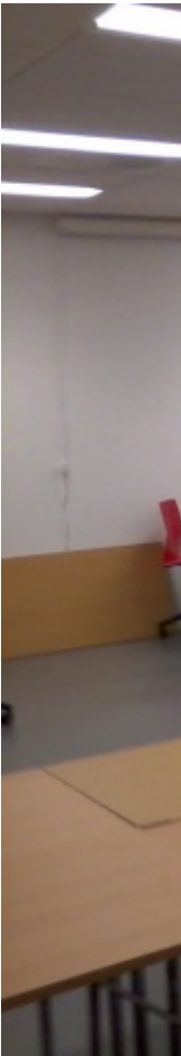
Auditorium B (C)